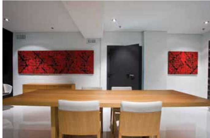
No matter one's whim, it's conveniently and smartly accommodated. Shown here, (top to bottom): the media room/theatre, the game hall, the dining room, and the party hall with a view to the car collection showroom.