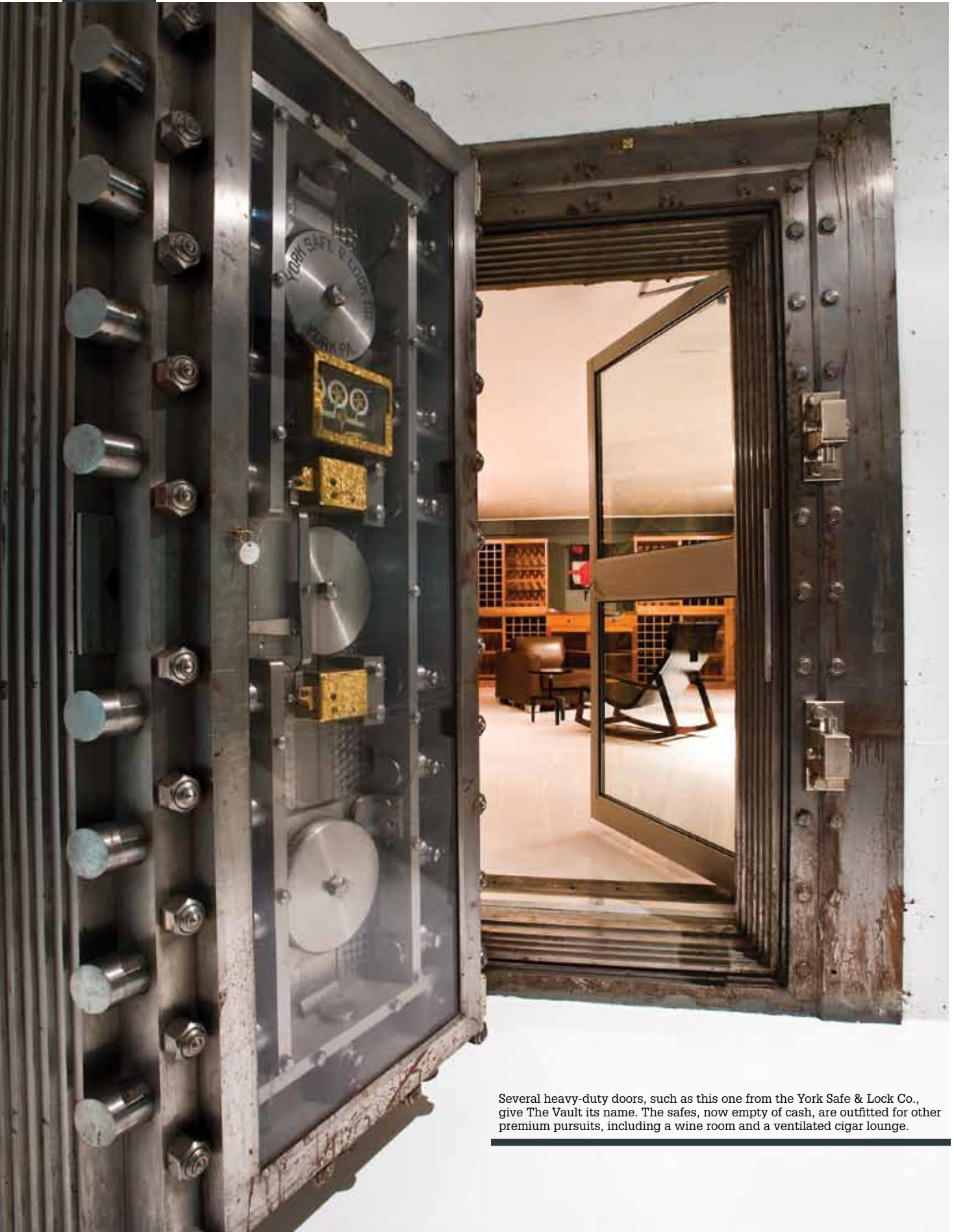
Several heavy-duty doors, such as this one from the York Safe & Lock Co., give The Vault its name. The safes, now empty of cash, are outfitted for other premium pursuits, including a wine room and a ventilated cigar lounge.